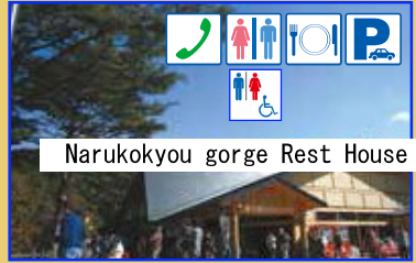
Narukokyou Gorge Rest House